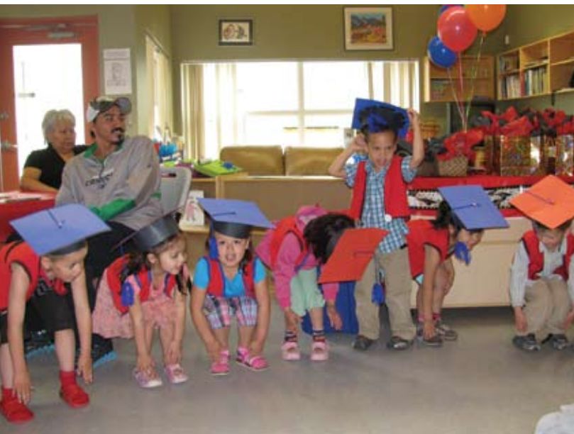
Graduates at the Dusk'a Head Start Family Learning Centre performed the "Head & Shoulders, Knees & Toes" song in Southern Tutchone for parents and guests on June 8th.

KDFN Lands department expects YECL to apply for a 25 year renewal in the next couple of years. They will be preparing for this longer license renewal application in the months to come.