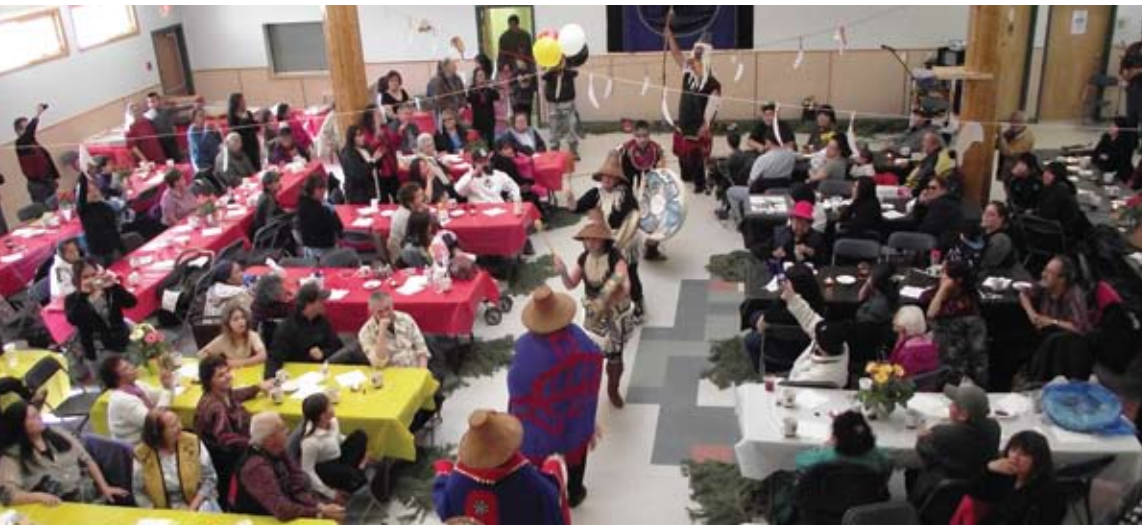
The Dakhká Khwáan Dancers performed at the swearing-in ceremony for the new Chief and Council. (See story inside!)

“Kwanlin people of Whitehorse, how are you?”