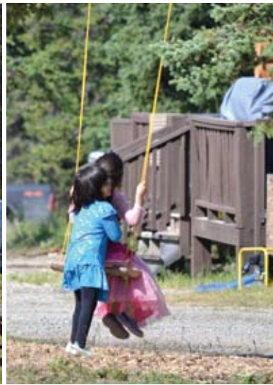
The General Assembly held at Jackson Lake in July was a great success. People really enjoyed the chance to be on the land and to visit with friends and family. The summer GA was held in response to citizens asking for more meetings and activities on the land.