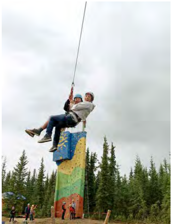
KDFN youth try ziplining during adventure-based summer program.