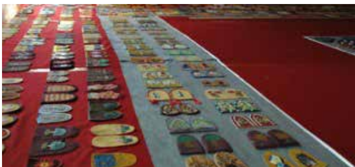
Walking with our Sisters exhibition to commemorate missing and murdered Aboriginal women across Canada.

Over 2,000 people visited the Walking With Our Sisters exhibition to commemorate missing and murdered Indigenous women.