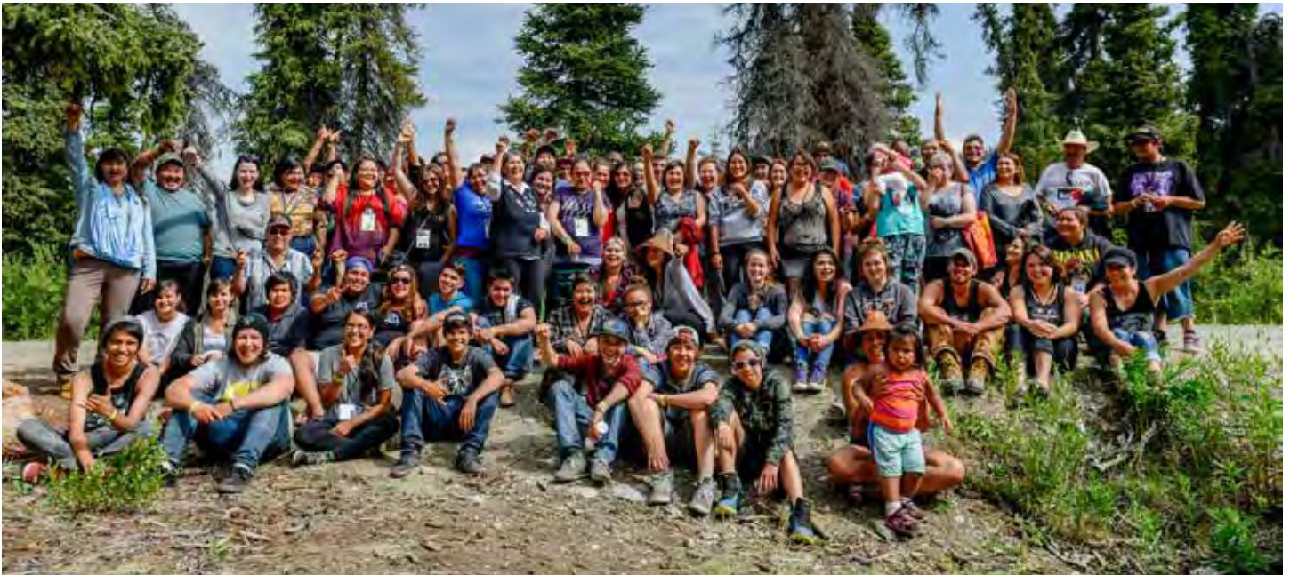
Over 100 youth from across the north participated in the three-day youth wellness gathering.

The Strength Within Circle: Youth Wellness Gathering empowered more than 100 youth to have healthy minds, bodies, spirits and hearts.