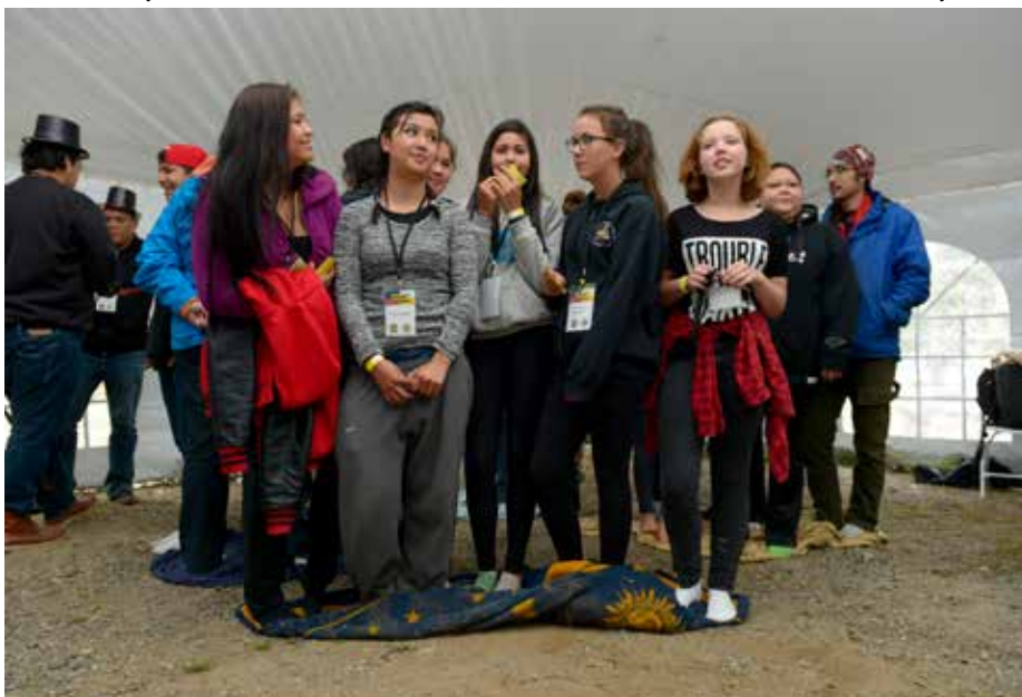
Blanket exercise on the history of Aboriginal people in Canada.

the feast, with participants joining the group to dance well into the night.