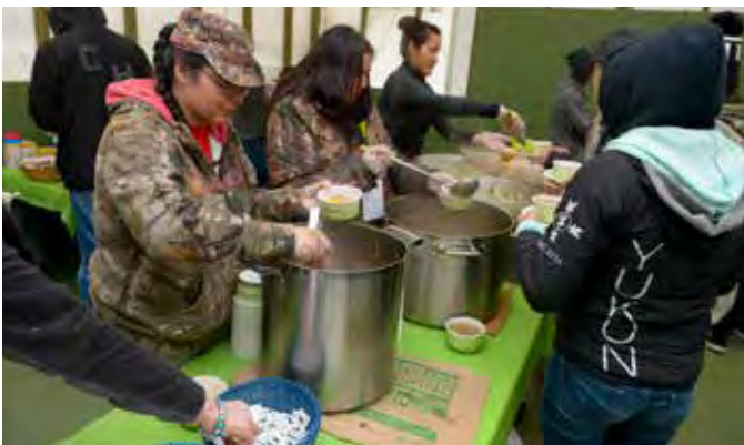
KDFN citizens serving lunch.