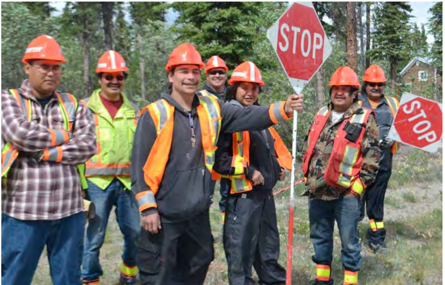
Taking a break for a photo during the traffic control training course that KDFN hosted during the summer months.

Learn more by contacting KDFN's Economic Development unit via KDFN's main phone line at 633-7800.