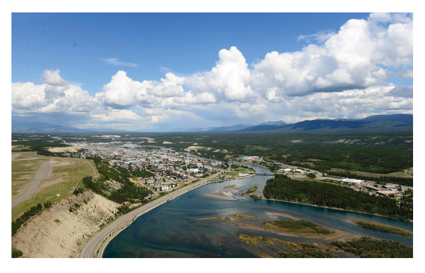
5.69% The percentage of land within the City of Whitehorse that is owned by Kwanlin Dün

Kwanlin Dün is the largest private land owner in the City of Whitehorse with 85 settlement land parcels totaling over 2385 hectares