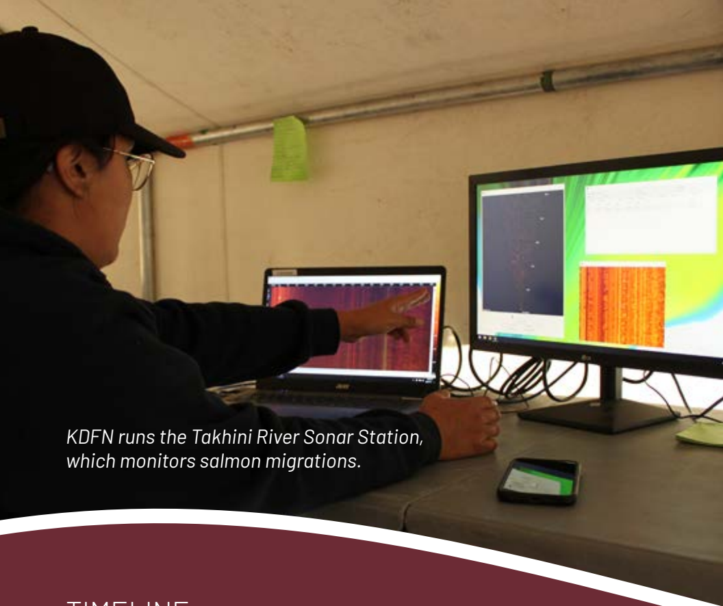
KDFN runs the Takhini River Sonar Station, which monitors salmon migrations.