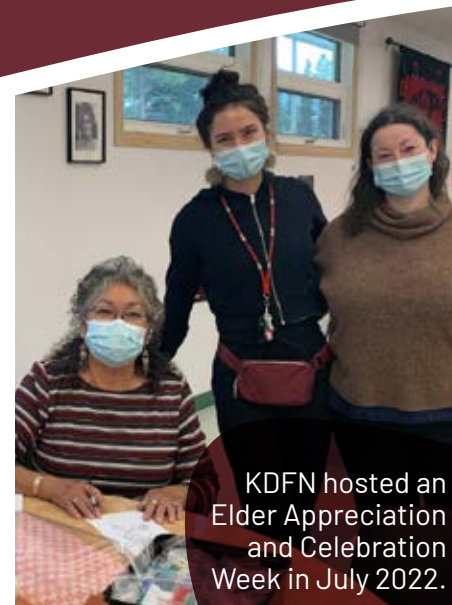
KDFN hosted an Elder Appreciation and Celebration Week in July 2022.